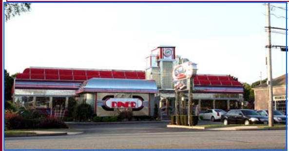
The On Parade Diner, in Woodbury, hosts monthly networking breakfasts for over 80 LICN members

Members enjoy many benefits including: education, networking, tuition refunds, LICN's website, two premiere cocktail parties, and discounted breakfasts.